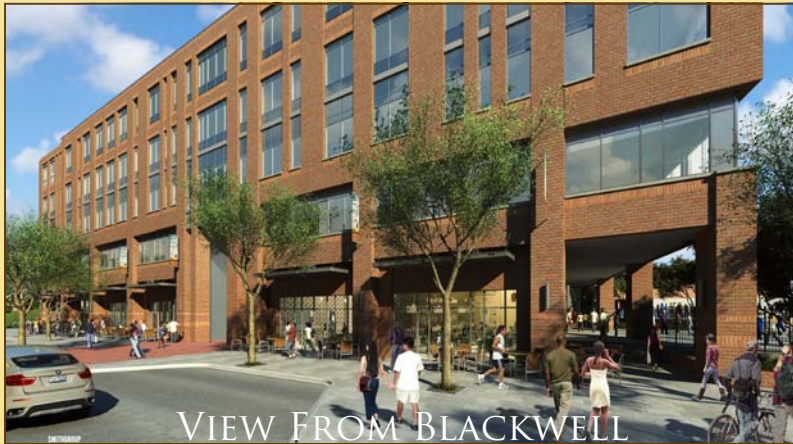
VIEW FROM BLACKWELL

359 Blackwell Street ■ Durham, NC 27701 ■ DiamondViewIII.com